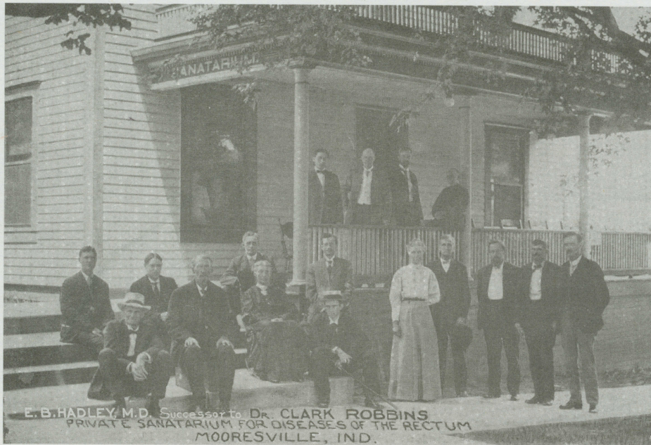
Picture from 1909 Mooresville High School Senior Annual